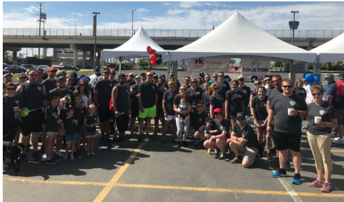
RK Heart Walk Team

Over 100 RK employees, their family and friends participated in the Denver Heart & Stroke Walk event this past June. The RK team raised a total of $8,489 through donations, a new silent auction and other fundraising events. The RK Foundation again matched the donations and fundraising and $16,978 was raised for the Southwest Chapter of the American Heart Association. This is almost $2,000 over the initial goal!