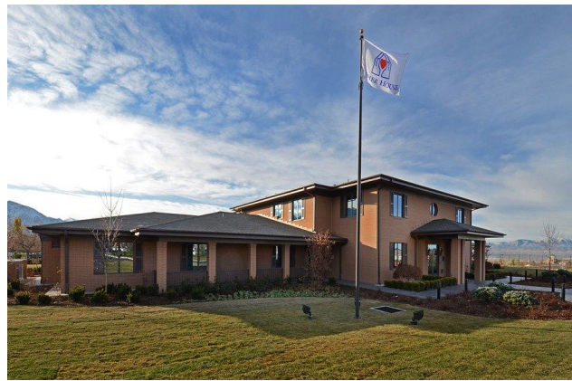
The Fisher House

The RK Foundation is proud to begin supporting charities making an impact in the Salt Lake City area. The Fisher House was selected by our Salt Lake City staff in appreciation of our military veteran employees.