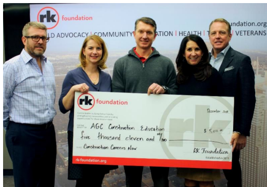
RK Foundation check presentation to AGC for the Construction Careers Now program.