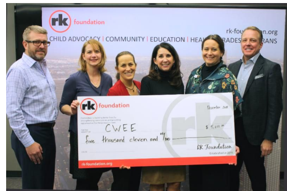
RK Foundation check presentation to CWEE.

The RK Foundation is pleased to support CWEE's workforce development program, Career Readiness. This data-driven program is designed to reduce poverty for low-income families by supporting participants in securing a living wage, aligning quality employment positions with participants' individual career goals, and providing wraparound services to families, ultimately leading them to self-sufficiency.