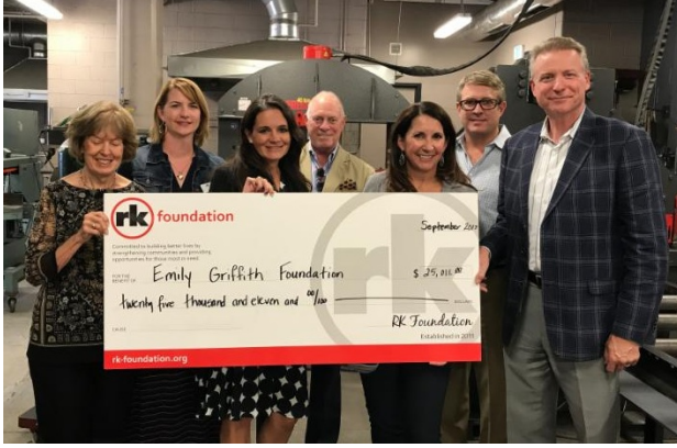
RKF Annual Check Presentation to the Emily Griffith Foundation

The RKF is pleased to support the Emily Griffith Technical College (EGTC) as they implement their new Virtual Reality Constructions Safety Training and Plumbing Quick Start Program. RKF has partnered with EGTC for several years to provide hands-on technical training for RKF's trade employees at their campus. In 2017, RKF donated $25,011 to the Emily Griffith Foundation .