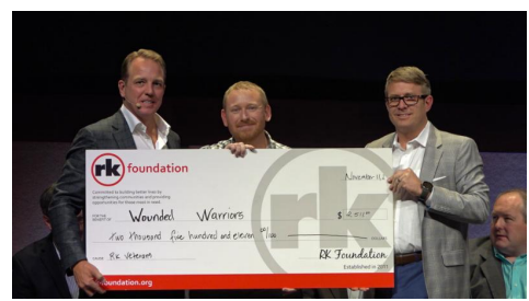
Veteran Check Presentation