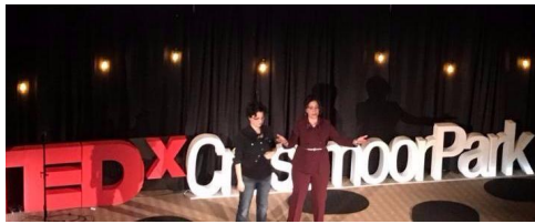
TEDx Event Photo

TEDx, coordinated by The Journey Institute , is a program of locally organized events that bring people together to share a TED-like experience. The TEDxCrestmoorParkWomen event focused on raw subjects, real women and relevant stories. The sold-out event occurred late October at the Cable Center on the University of Denver campus.