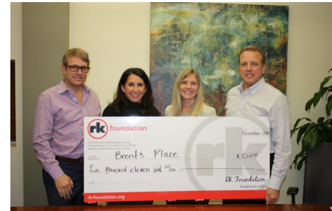
Grant Check Presented to Brent's Place

Brent's Place provides a safe and clean housing facility for immune compromised children, patients and their families to aid in healing and recovery. RK is helping to build the second Brent's Place facility in Denver, and the RK Foundation surprised this great organization with a donation to support their important work.